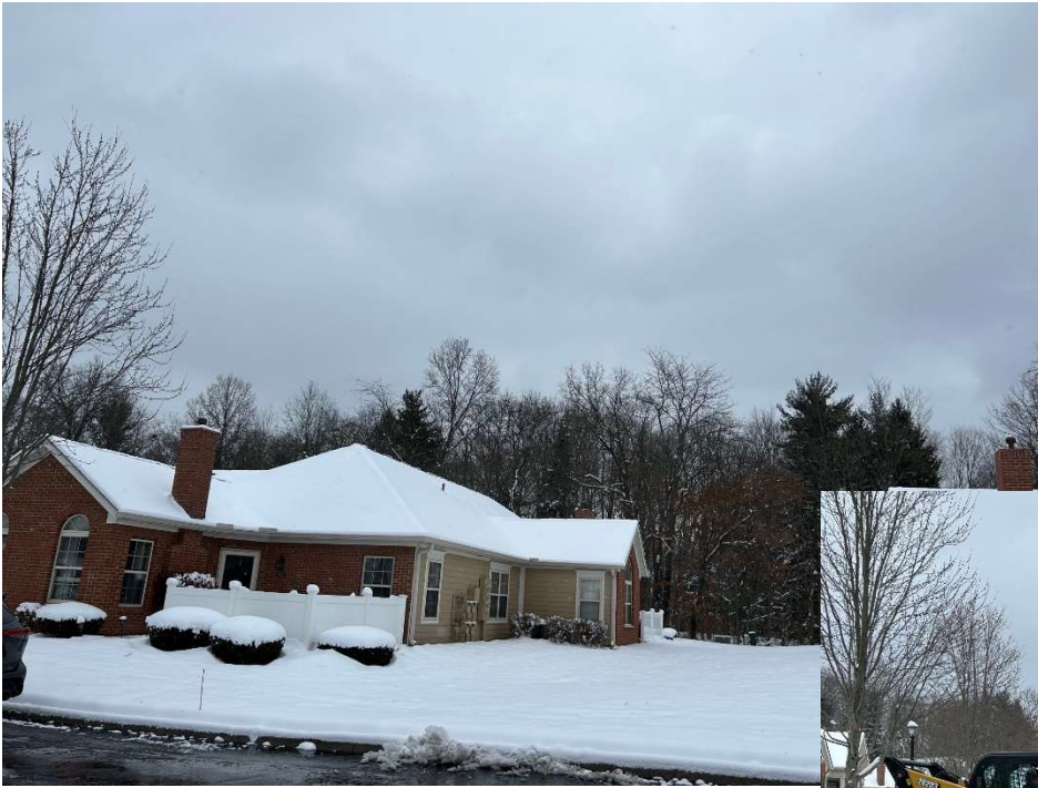
Eileen Godin's condo