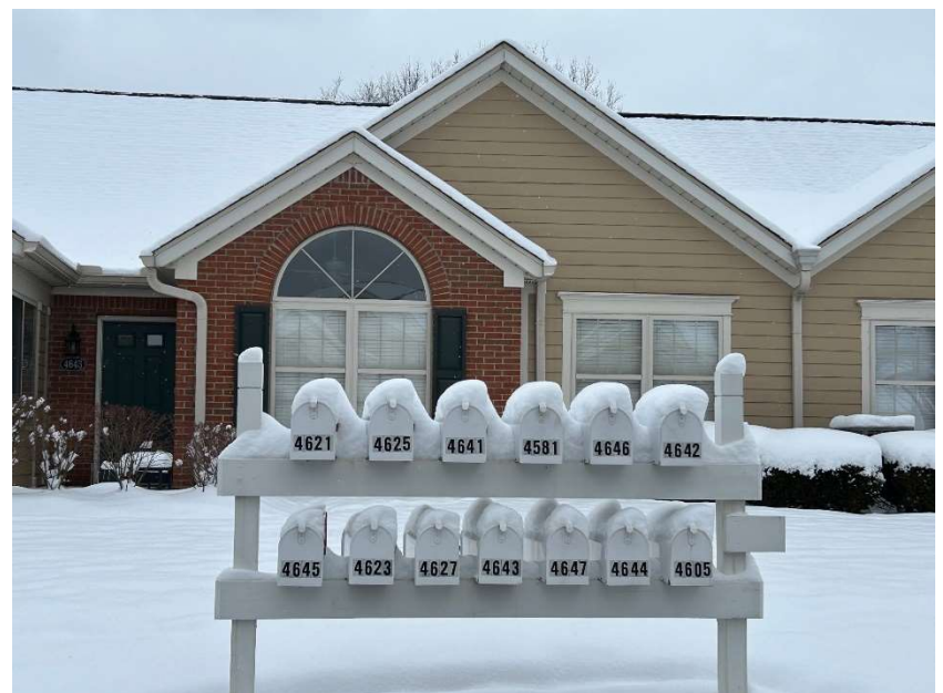
Wenham Park mailboxes