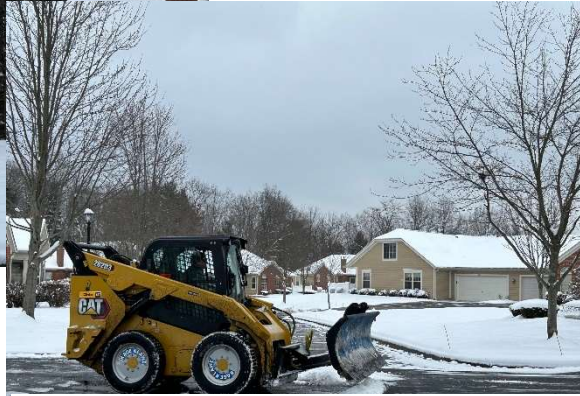
Hedge Landscaping plowing Collingville Way