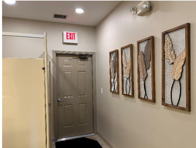
Mens Restroom exit to pool area