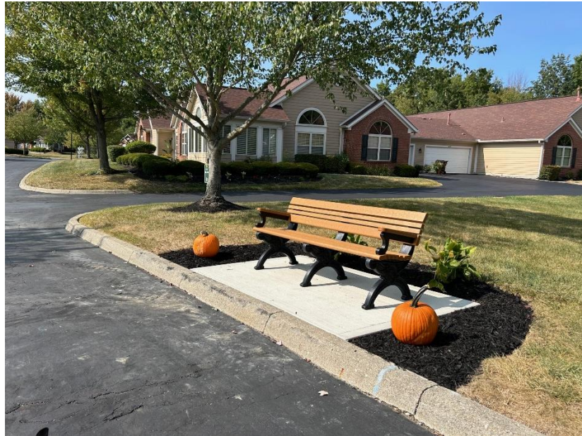
Collingville Way curve by mailboxes