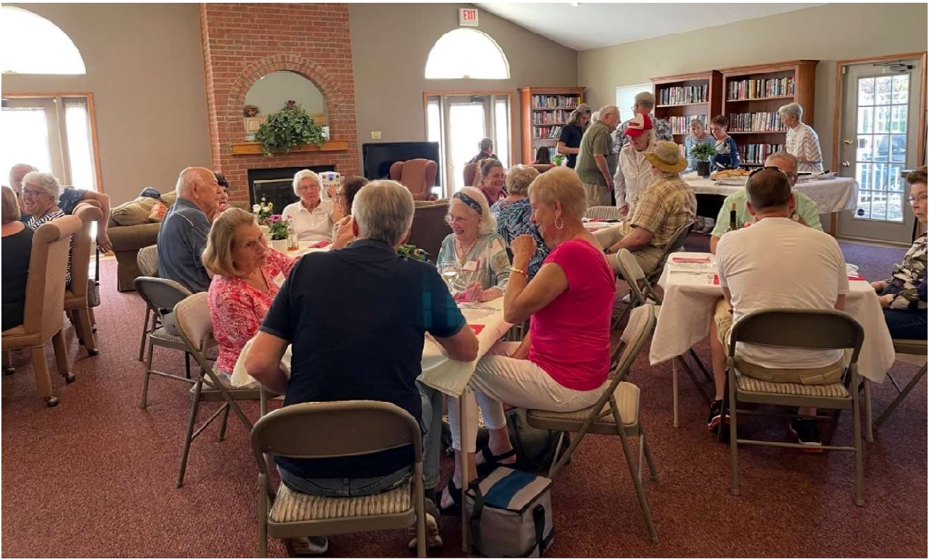
Social time for all