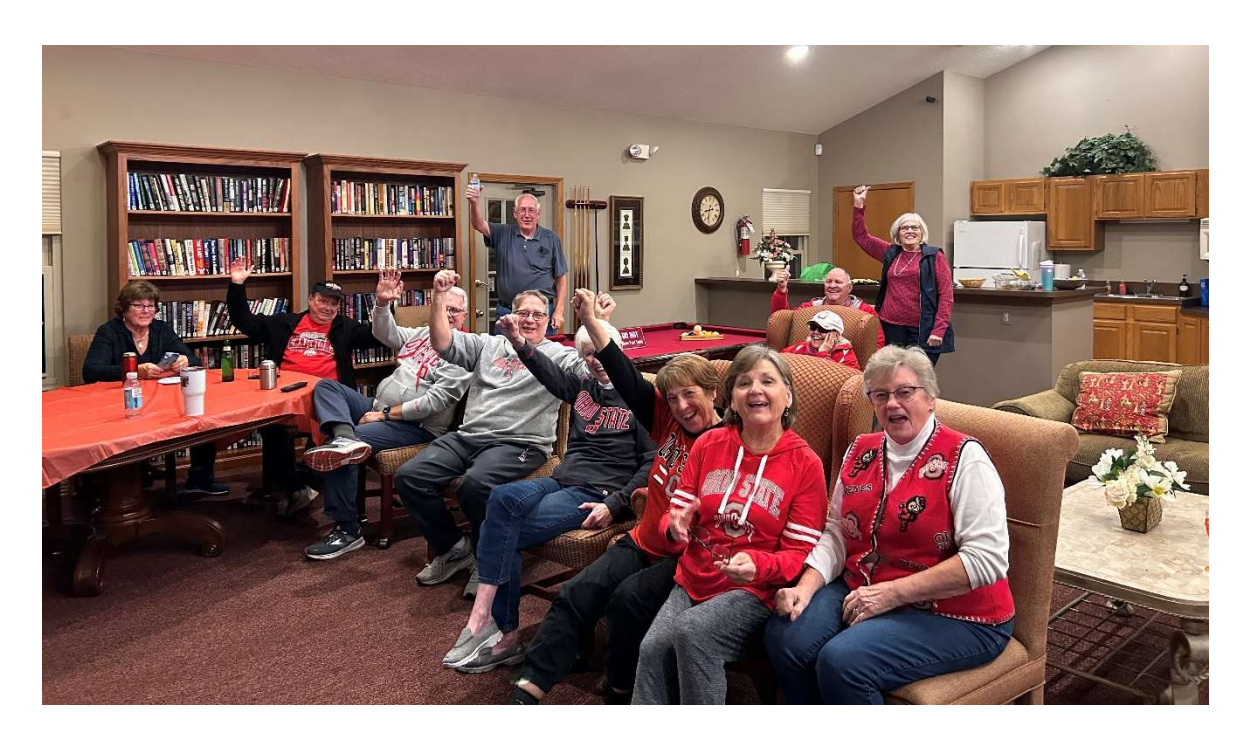
Fall Color in our Community!!